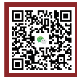
WeChat Official Account

更多资讯, 欢迎关注 For more information, please follow us on 微信公众号 WeChat Official Account: 西电科大国际教育学院 School of International Education, Xidian University